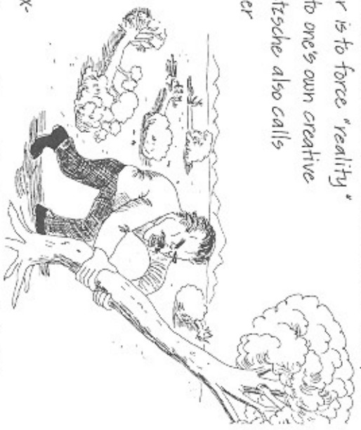
Forcing Reality to Bend to One's Will

manifestations of this desire for freedom, even though in most cases these instincts have been constrained by the forces of normalization (themselves other manifestations of will to Power, or, manifestations of the will